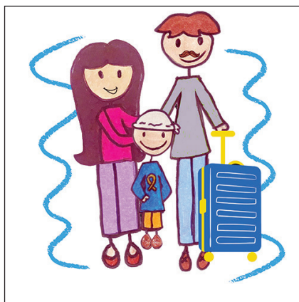
Below: An illustration from the finished book.